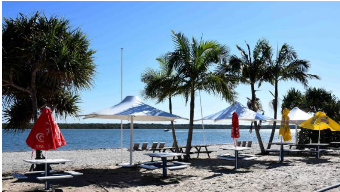
Couran Cove on Stradbroke Island is undergoing a makeover.