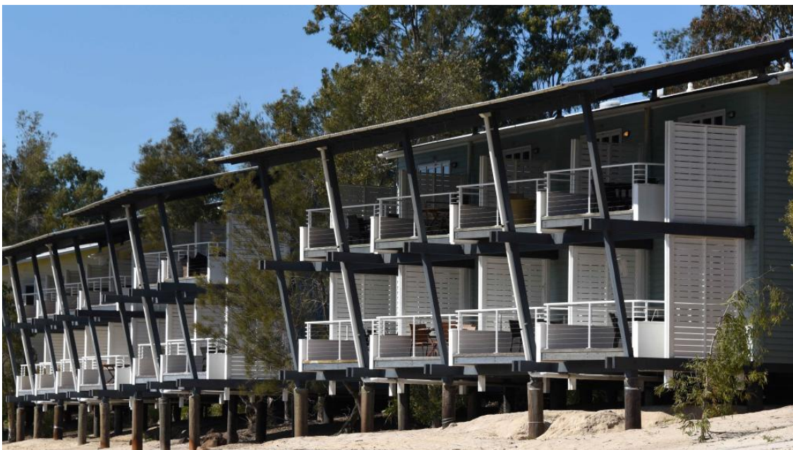
Couran Cove on Stradbroke Island offers rentals half of the median price on the Gold Coast.