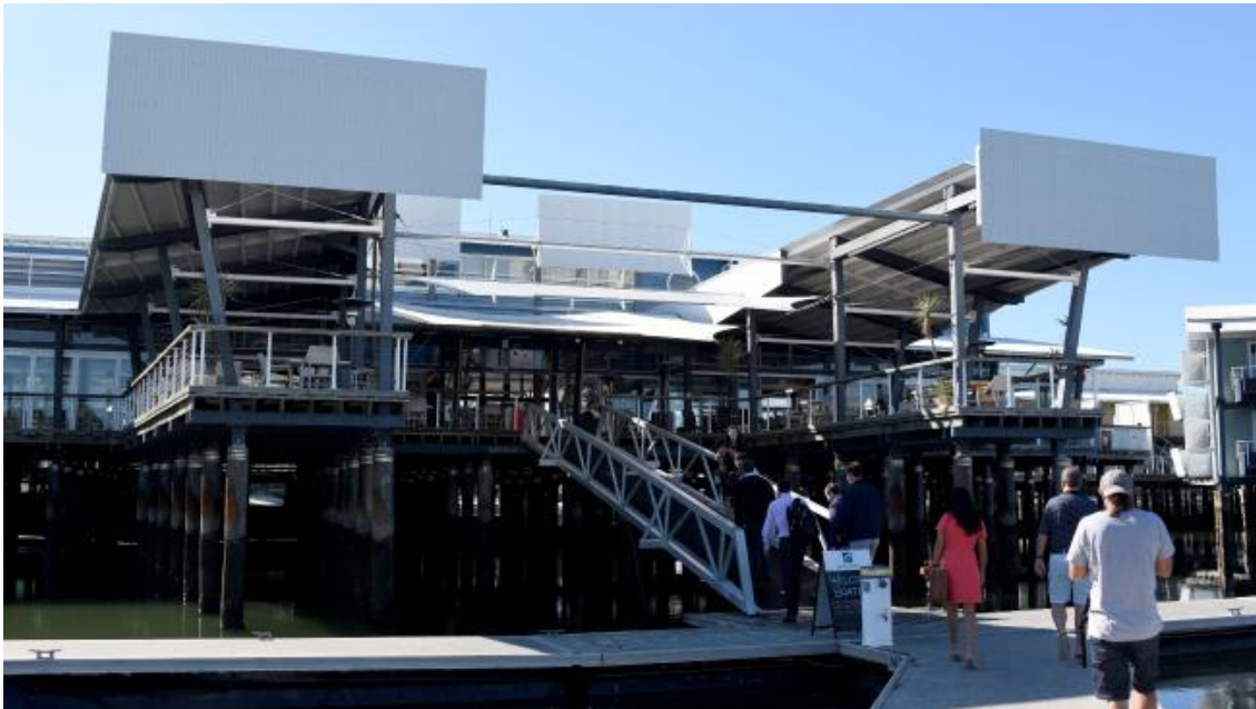
Couran Cove on Stradbroke Island is dubbed the new micro-suburb of the Gold Coast.

It has become a haven for residents trying to escape the steep mainland rental market where median prices have skyrocketed to $460 a week, according to CoreLogic.