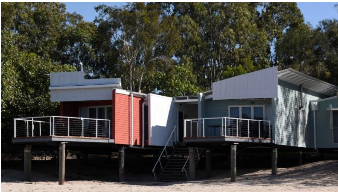
Couran Cove on Stradbroke Island offers rentals about half of the median rent on the Gold Coast.

“We see the long-term future for this incredibly beautiful place being greatly enhanced by the inclusion of a resident population. It’s about creating a functional, living community that blends holiday-makers with permanent residents.”